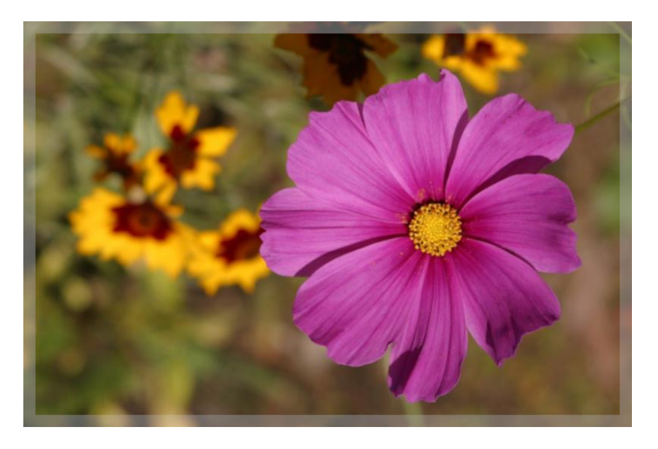
Figure 3 - Expanding the marked area with "media-overprint" = 'scale'

Figure 3 illustrates the 'scale' overprint method, where the Printer scales up the Input Page to expand the Impression's size.