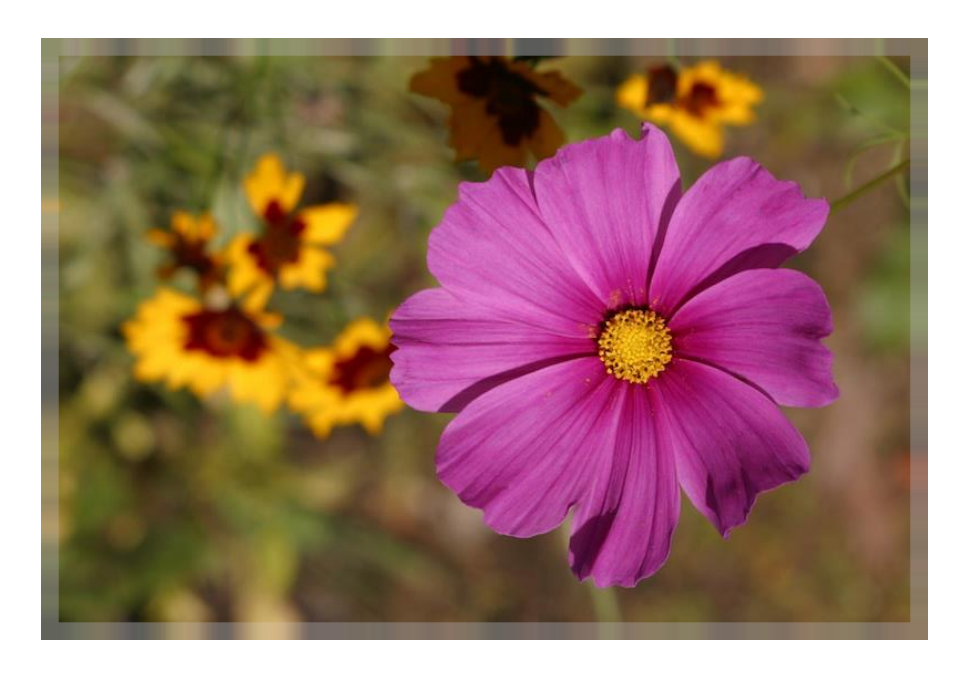
Figure 2 - Expanding the marked area with "media-overprint" = 'extend'

Figure 3 illustrates the 'scale' overprint method, where the Printer scales up the Input Page to expand the Impression's size.